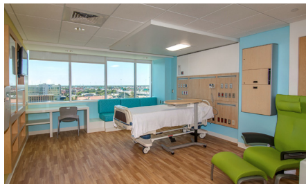
CHRISTUS Health System, Children's Hospital; $109,068,252; 400,000 SF; San Antonio, TX