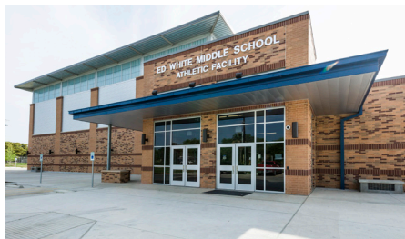
North East ISD, White Middle School Campus Improvement Project; $10,459,407; Campus-wide; San Antonio, TX