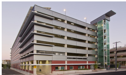
Bexar County, Courthouse Parking Garage & Office Space; $12,697,368; 235,889 SF; San Antonio, TX