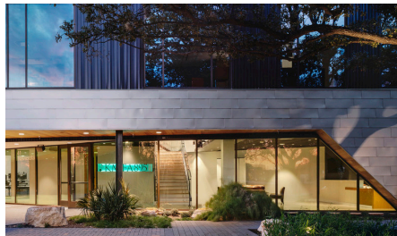
Legacy Alliance Holdings, LLC, Villas at the Rim; $67,000,000; 427 units; San Antonio, TX