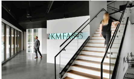
CRP/Bodner Companies, 120 Ninth Street; $31,300,000; 220 units; San Antonio, TX