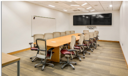
Texas A&M University, Center for Infrastructure Renewal (CIR); $64,568,378; 138,891 SF; Bryan, TX