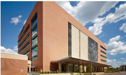
University Health System, Robert B. Green Campus; $108,244,845; 300,000 SF; San Antonio, TX