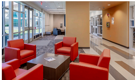
Lone Star College, East Aldine Satellite Center; $36,355,398; 109,743 SF; Houston, TX