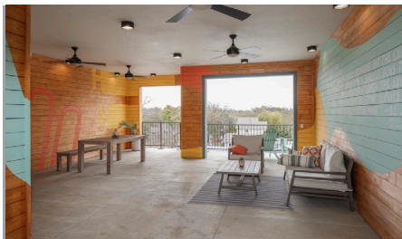
The Brownstones at Englewood South, Residential; $73,972,304; 350 multi-family units; Englewood, NJ