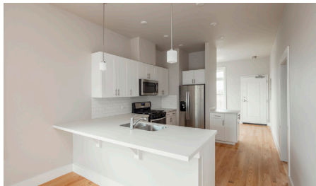
Sam Houston State University, Student Housing Village; $14,113,561; 129,731 SF; Huntsville, TX