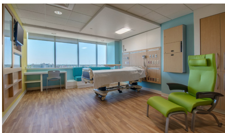
CHRISTUS Health System, Children's Hospital; $109,068,252; 410,000 SF; San Antonio, TX