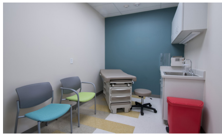
UT Health, UT Health Hill Country (MARC North); $12,015,759; 18,000 SF; San Antonio, TX