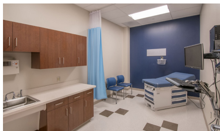
Center for Healthcare Services, Paul Elizondo Adult Behavioral Clinic; $31,006,668; 106,538 SF; San Antonio, TX