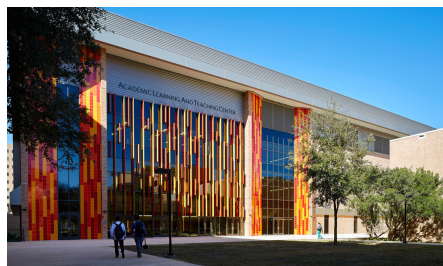
University of Texas System, Academic Learning & Teaching Center; $39,327,476; 125,000 SF;