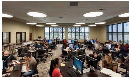
Texas A&M University San Antonio, Senator Frank L. Madla Building; $29,080,934; 92,343 SF; San Antonio, TX