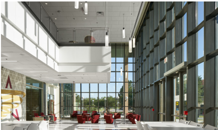
Texas A&M International University, Addition of Instructional and Support Spaces; $61,551,745; 114,820 SF; Laredo, TX