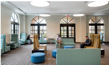
Texas A&M University San Antonio, Central Academic Building & Patriots' Casa and Auditorium; $58,705,022; 205,000 SF; San Antonio, TX