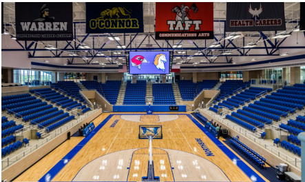
Northside ISD, Sports Gymnasium; $26,632,762; 88,000 SF; San Antonio, TX