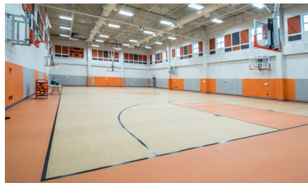
Medina Valley ISD, Loma Alta Middle School; $30,599,000; 158,416 SF; San Antonio, TX