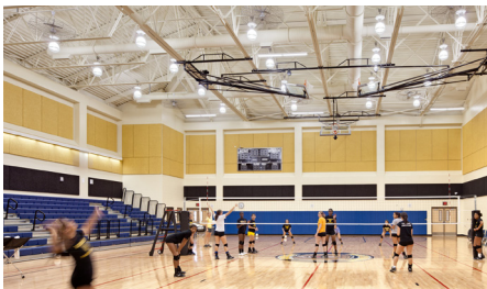
Northside ISD, William J. Brennan High School; $87,497,118; 454,000 SF; San Antonio, TX